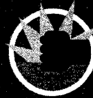
Damage of Property