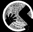
Taking of Property