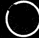
Restraining the Freedom and Liberty of a Pupil or Student