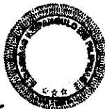
BENIGNO S. AQUINO III President of the Philippines