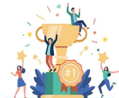
“5S Promotion and Recognition” as header