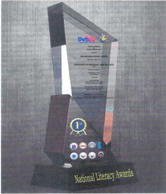
(Sample Glass Plaque for 1st to 5th Place NLA Winners)