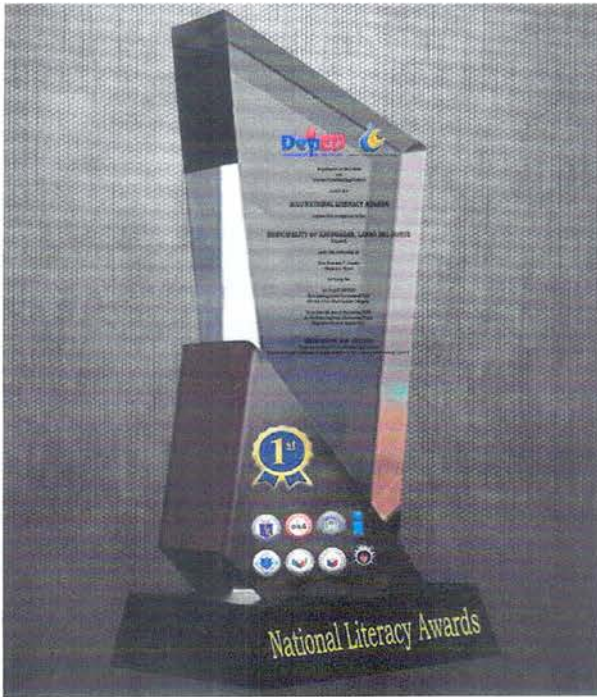
(Sample Glass Plaque for 1st to 5th Place NLA Winners)