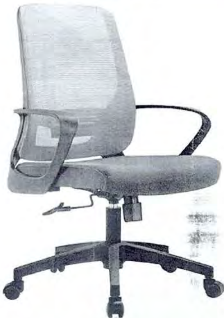
Sample picture only