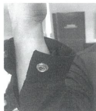
SNAP BUTTON IN WRIST